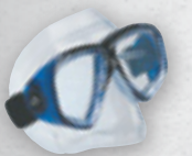
Europa™ 2 Purge