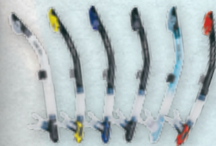
Cuda Dry Mini™