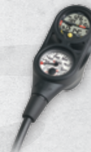
XR-1 Nx TM