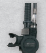
Air Link Octo Inflator™